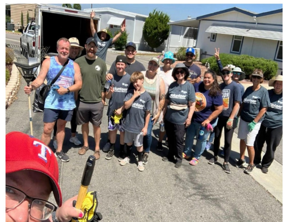
Elder Care: Habitat for Humanity