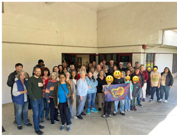
Care kits for unhoused friends